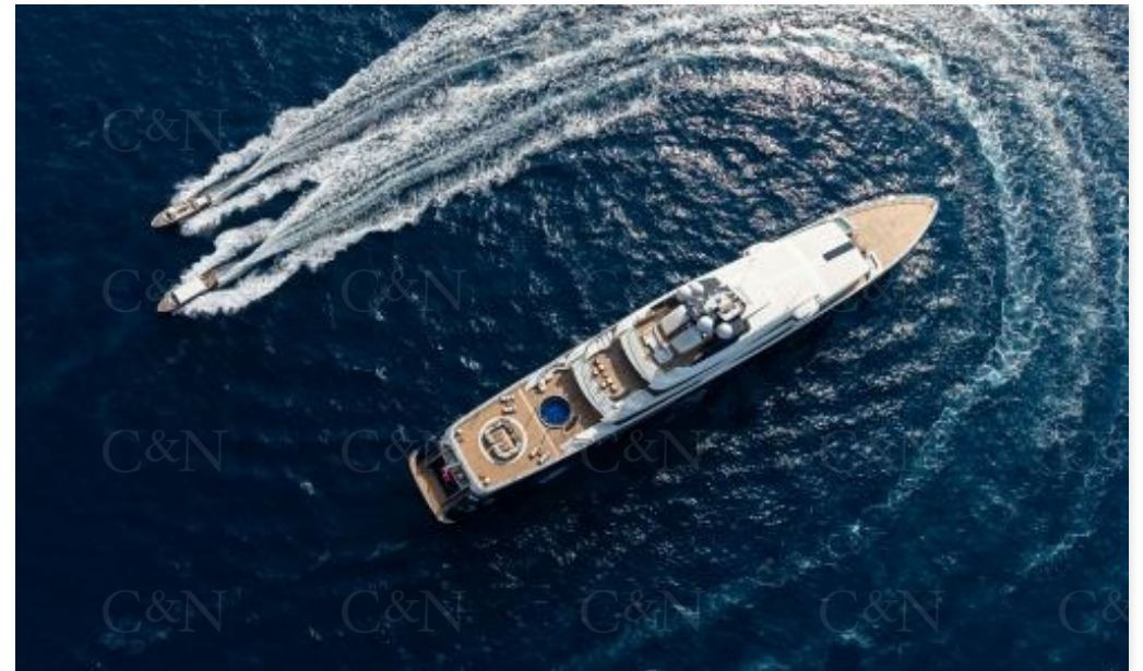
TRANQUILITY | 91.50m (300ft 2in) | Oceanco | 2014