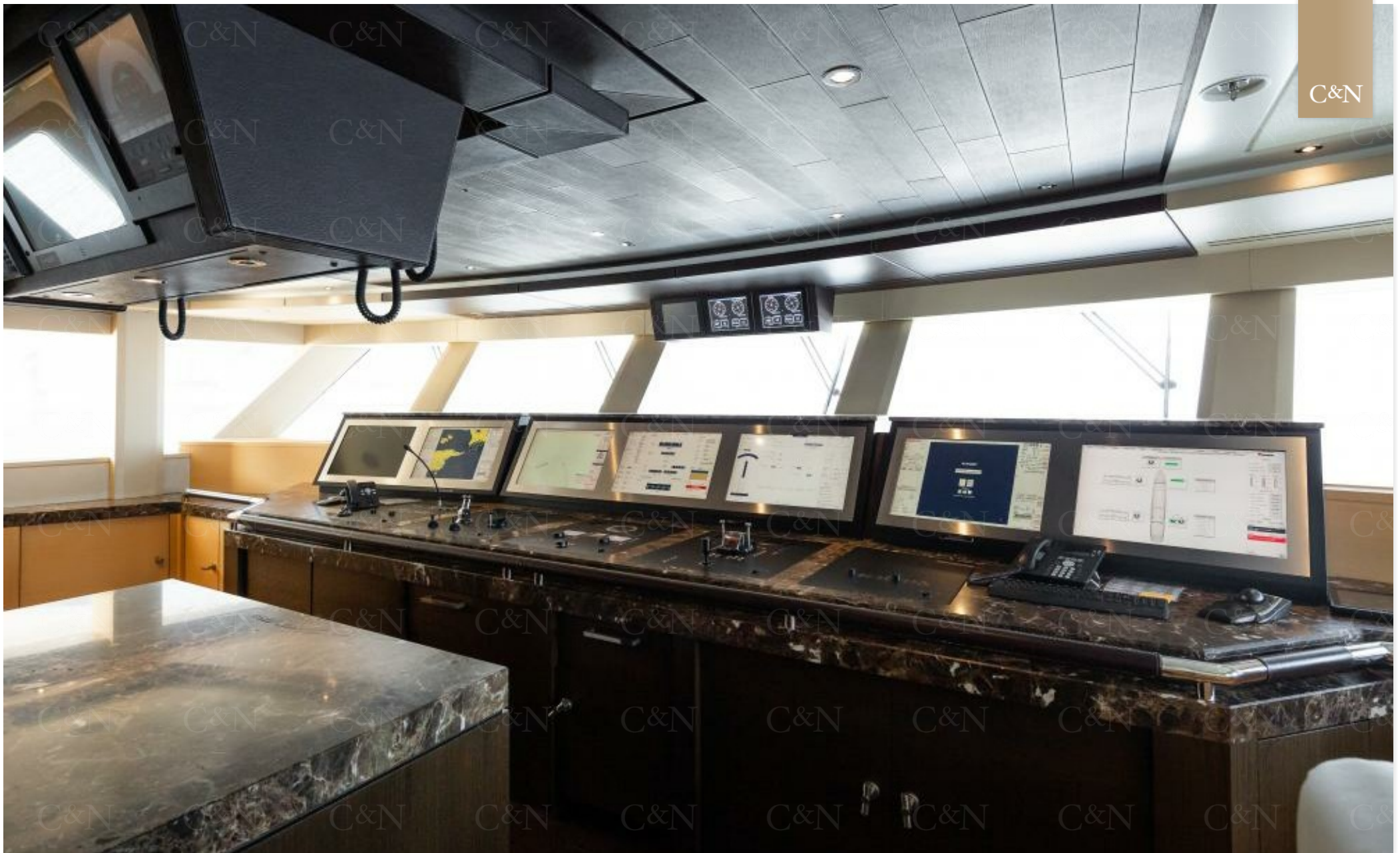
TRANQUILITY | 91.50m (300ft 2in) | Oceanco | 2014