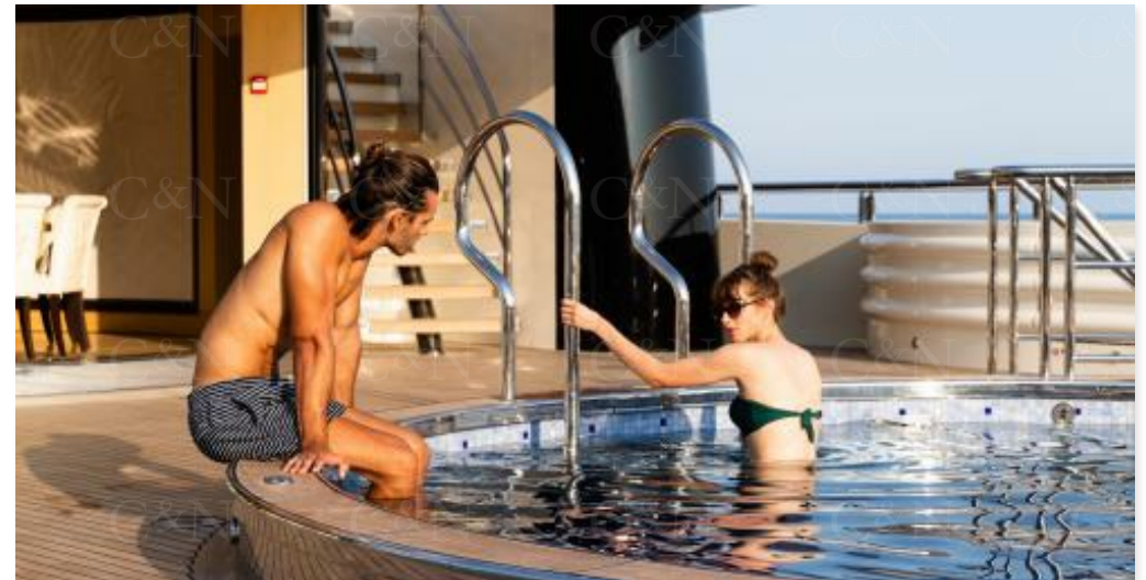
TRANQUILITY | 91.50m (300ft 2in) | Oceanco | 2014