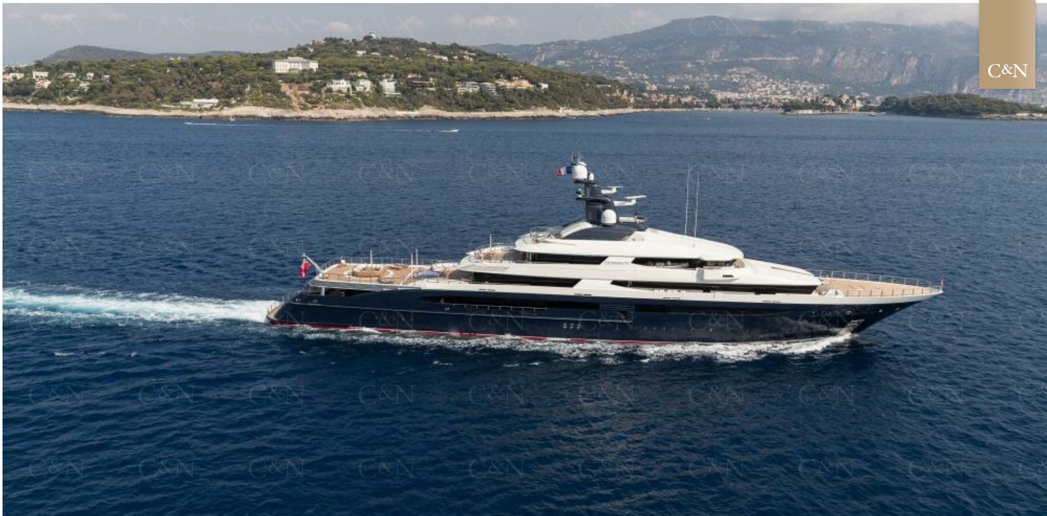
TRANQUILITY | 91.50m (300ft 2in) | Oceanco | 2014

The original Yachting Company luxury experts since 1782