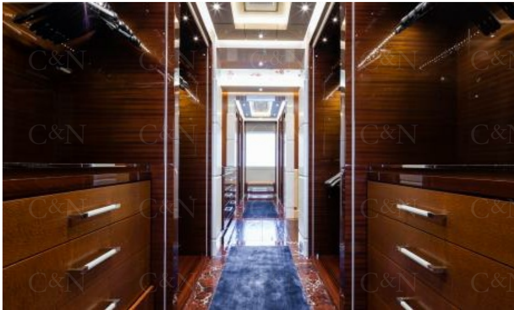
TRANQUILITY | 91.50m (300ft 2in) | Oceanco | 2014