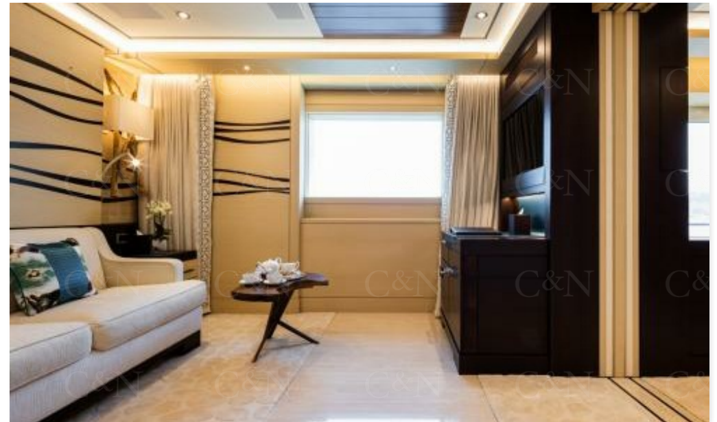
TRANQUILITY | 91.50m (300ft 2in) | Oceanco | 2014