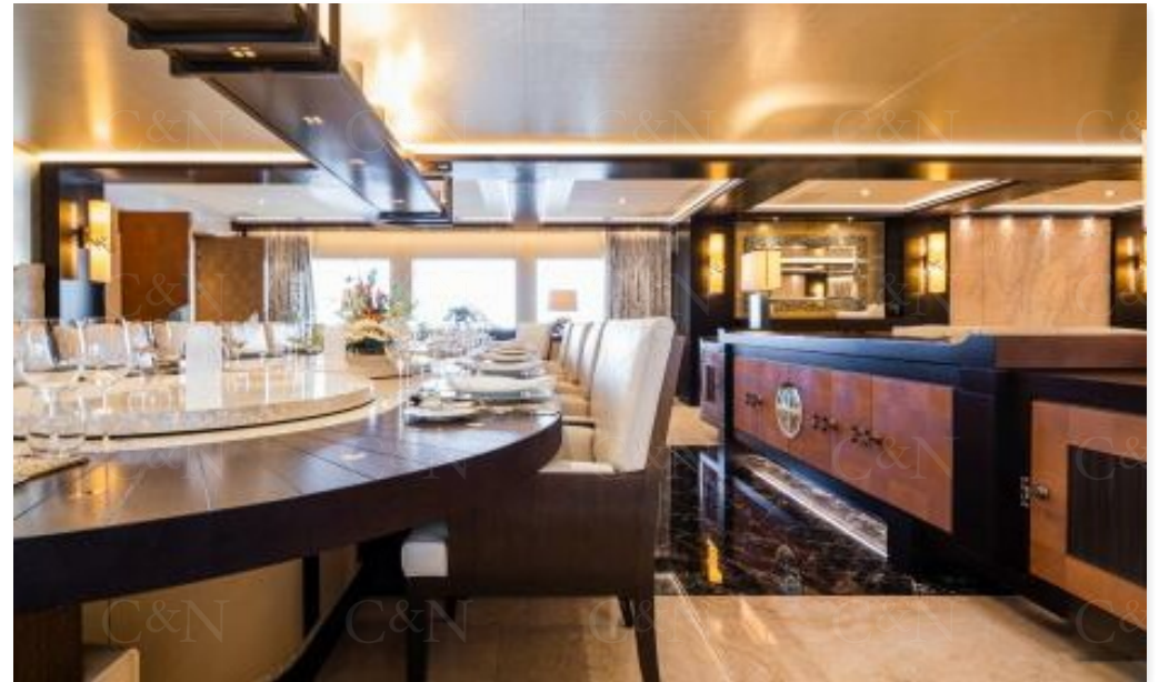
TRANQUILITY | 91.50m (300ft 2in) | Oceanco | 2014