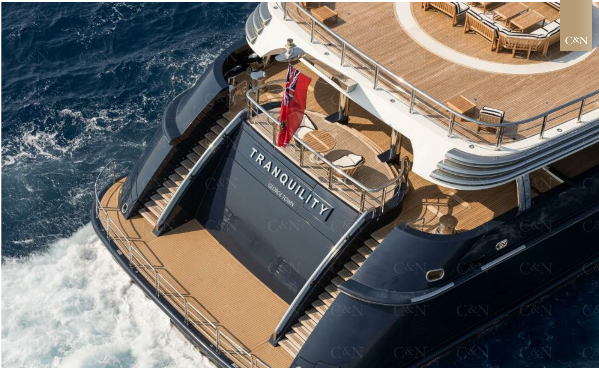
TRANQUILITY | 91.50m (300ft 2in) | Oceanco | 2014