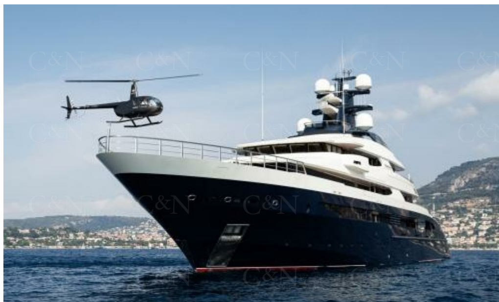
TRANQUILITY | 91.50m (ft 2in) | Oceanco | 2014